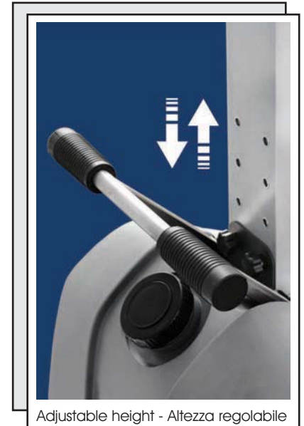
Adjustable height - Altezza regolabile

Fill up the tank with clean fresh water, plug-in, switch on. In a while a fresh breeze will make your summer more pleasant.