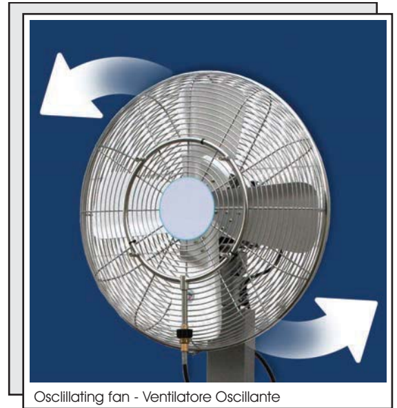
Oscillating fan - Ventilatore Oscillante

Finally! Enjoy a cool summer also outdoor and without fixed installations. MOBI-COOL is really a special fan, quiet, effective, fully autonomous with a high capacity water tank that guarantees from 3 up to 5 hours of autonomy. MOBI-COOL is quiet, its electrical QES motor and pump are noiseless, less than 55 dB noise emission, thanks to a low consumption technology designed for applications in environments requiring low noise emissions.